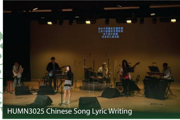
HUMN3025 Chinese Song Lyric Writing