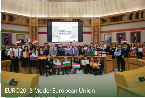
EURO2015 Model European Union