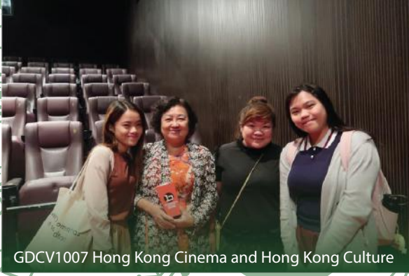
GDCV1007 Hong Kong Cinema and Hong Kong Culture