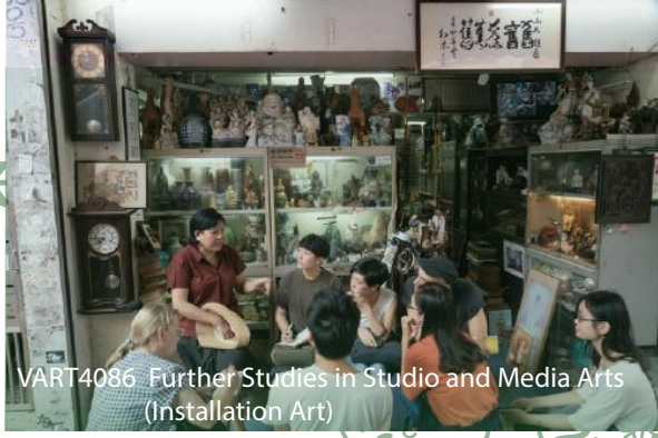
VART4086 Further Studies in Studio and Media Arts (Installation Art)