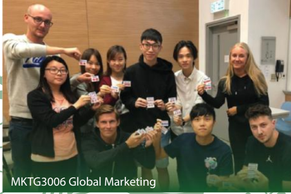
MKTG3006 Global Marketing