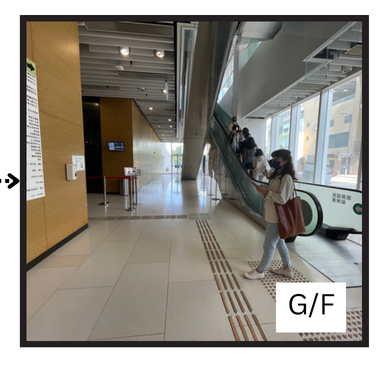
1. Go to the Academic and Administration 2. Go to 3/F by lift or escalator Building(AAB)