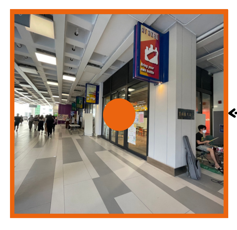
4. TriAngle is HERE!