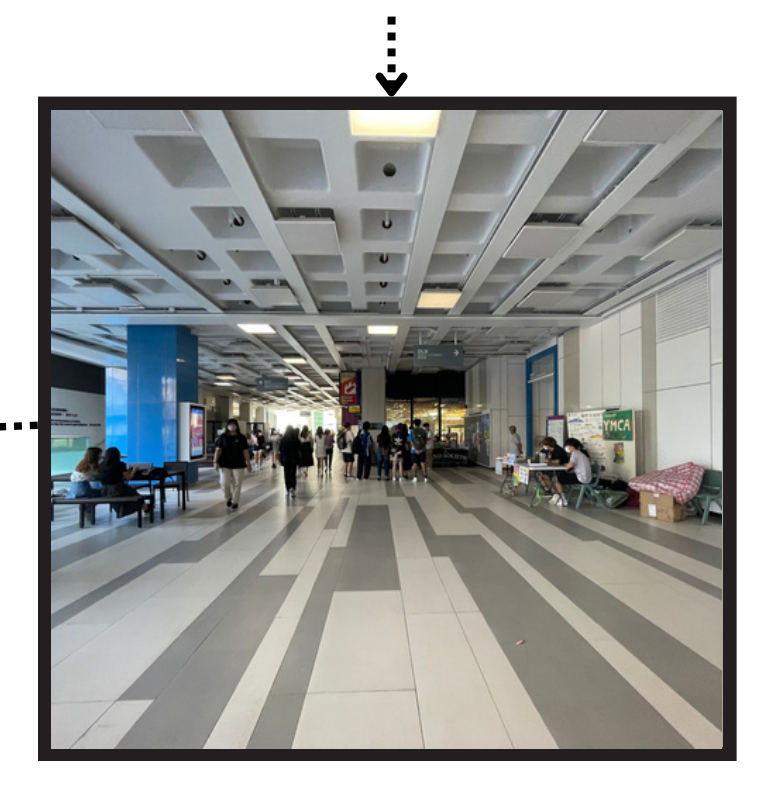
3. TriAngle is in front of you!