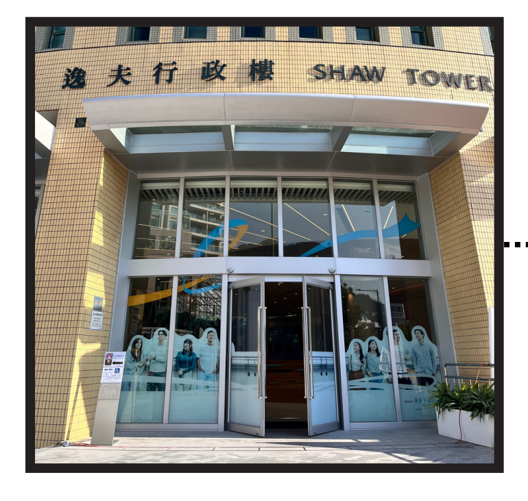
1. Go to the Shaw Tower Entrance