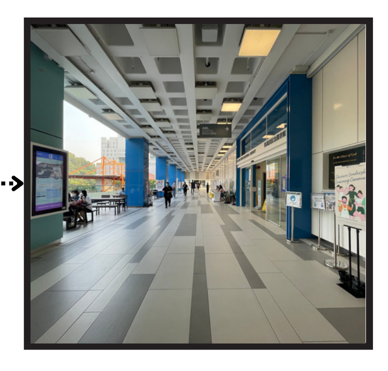
2. Keep walking forward